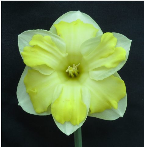
Seedling from Nial Watson, Ringhaddy Daffodils

W740 11aW-Y Pampaluna x Trumpet Warrior. Flowers early-mid season to be registered but no name as yet. Opens with a pale yellow corona with a deep yellow rim but fades as it matures to a slightly deeper yellow with a less obvious rim.