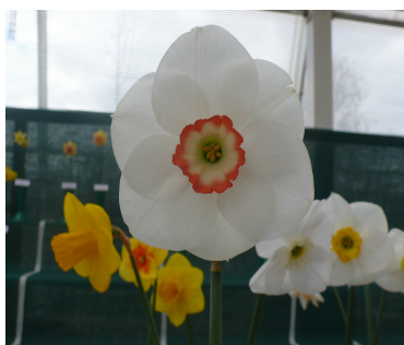
Left: W763 3W-GWP Parksprings x Newcomer. Lovely flower smallish, not an intermediate here. Early-mid season.