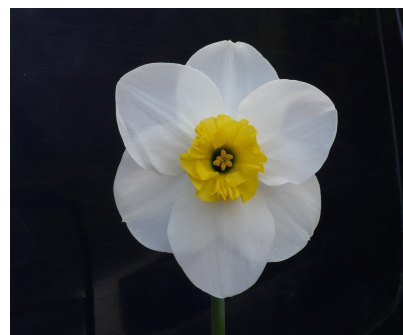
Right: W785 3W-Y Limpopo x Evesham Big flowering Mid- Late Season. To be named Congratulations.