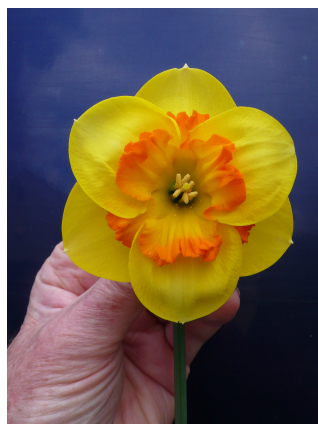
Left: W789 11aY-YYO Angelito x Pampaluna. Mid-season. Intermediate to be named Wee Cracker It has already had a 1st at RHS in 2014 and was best Any Other Division in Ballymena show this year. Small and consistent here