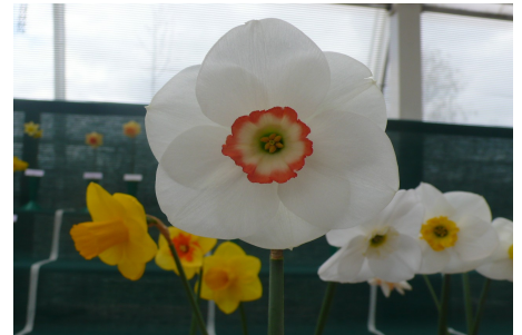
W818 11aY-O intermediate.

W763 3W-P small, might be an intermediate with you, but is not with us.