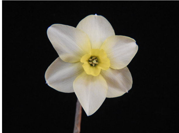
Kathy Welsh: FO6-7 Spindletop x n. jonquilla ADS Rose Ribbon from the WDS 2017 Show